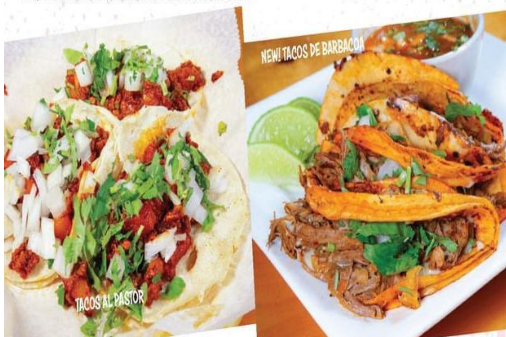
NEW! TACOS DE BARBACOA

Consumer Advisory: Consumption of raw and undercooked animal food is dangerous to your health. If you request raw or undercooked food you are putting yourself in danger of food-borne illness and take the responsibility upon yourself to order such products.