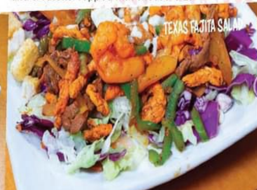
TEXAS FAJITA SALAD