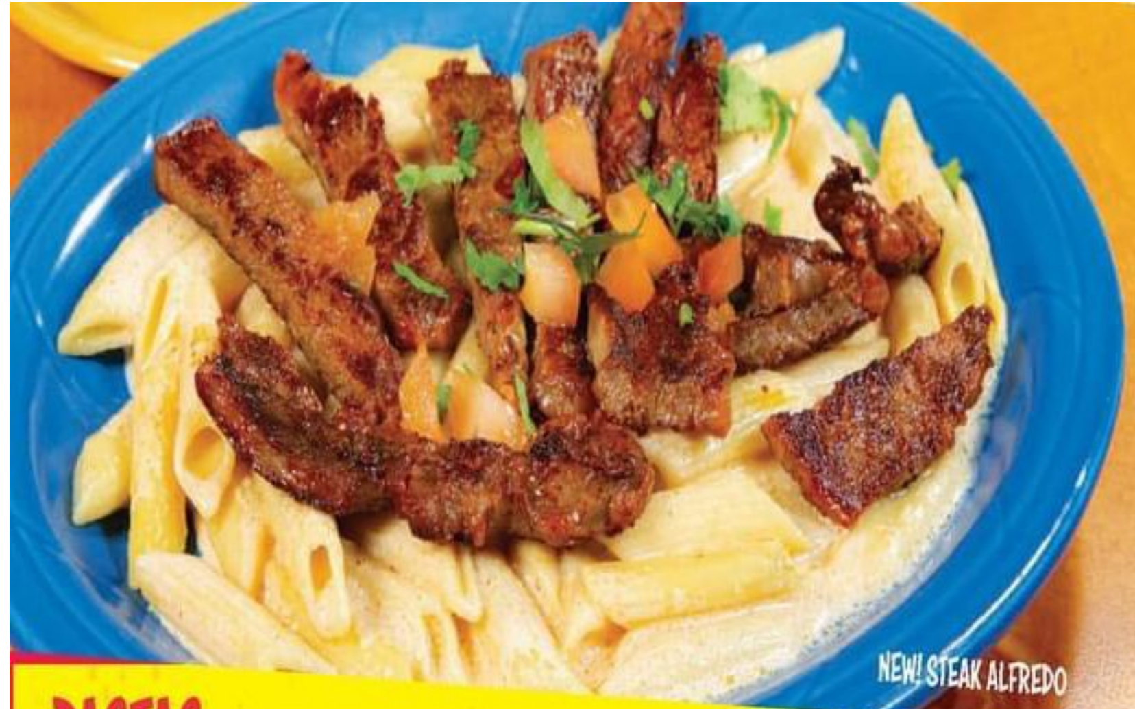
NEW! STEAK ALFREDO