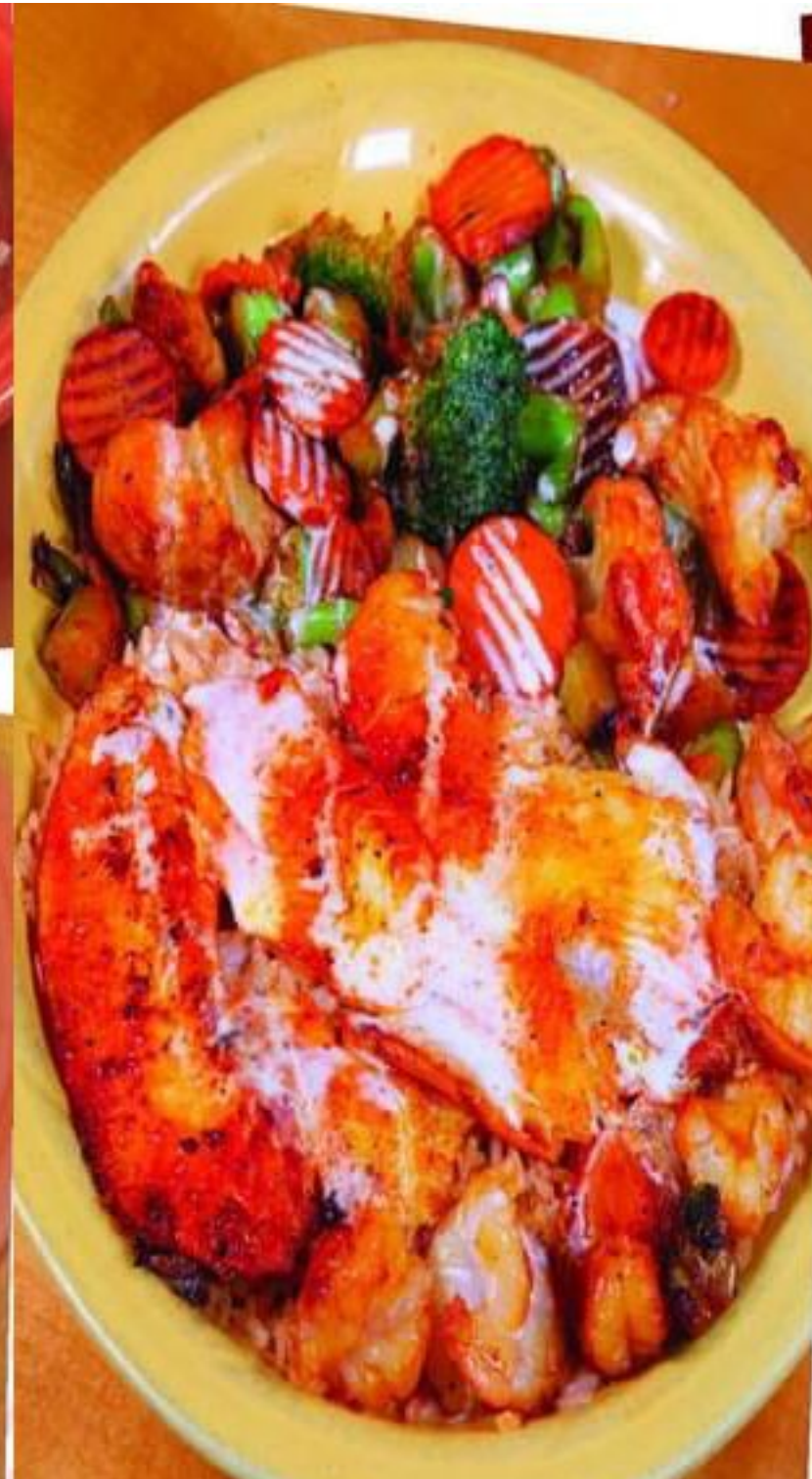
PESCADO A LA GRILL

A flour tortilla grilled and stuffed with cheese and barbacoa, served with rice and sour cream salad. 11.99