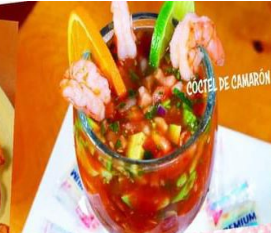
CÒCTEL DE CAMARÓN