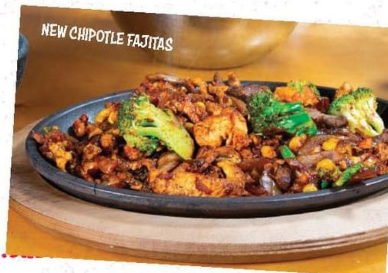
NEW CHIPOTLE FAJITAS

Grilled steak or chicken cooked with onions, tomatoes and bell peppers for two. Served with 2 sides of rice, beans, salad and tortillas. 18.99